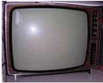
← Analog TV