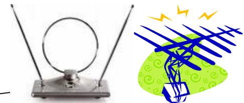
Indoor or Outdoor Antenna