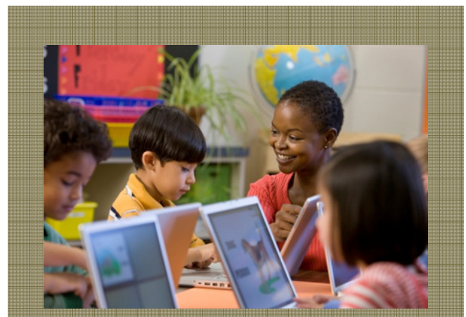
CET helps teachers make the best use the latest classroom tools to engage and excite young learners.

CET provided professional development workshops to 772 educators in 5 counties in greater Cincinnati. We are direct partners in education with two elementary schools, John P. Parker and Pleasant Hill Academy as well as the nationally recognized School for the Creative & Performing Arts. As education partners we provide PBS and CPB sponsored services that include, though not limited to, Martha Speaks Reading Buddies, Super Why Reading Camps & Raising Readers Library Corners