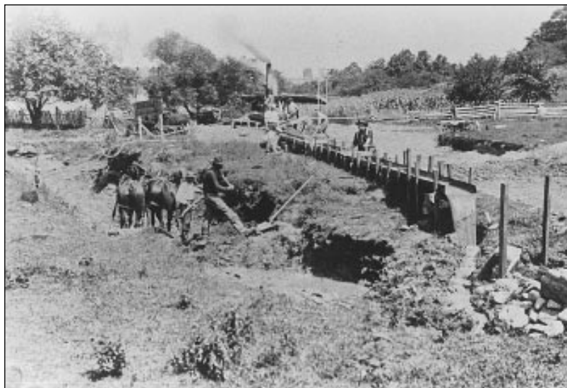
Sluice operation along Deadmans (Steltzs) Run, north of Bellville, Richland County, 1905. This operation was short lived.