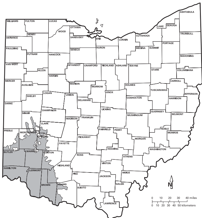
Outcrop area of Ordovician rocks in Ohio.