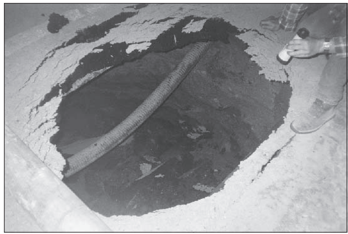
Subsidence pit, about 6 feet across and 8 to 10 feet deep, on I-70 resulting from roof collapse of a mine in March 1995.