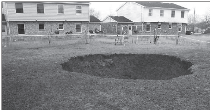
This subsidence pit behind a residence in North Canton, Stark County, was 35 feet across and 25 feet deep.

Abandoned underground mines are found in 35 counties in Ohio. Tuscarawas County has the most known abandoned underground mines at 419. Although clay, shale, limestone, iron ore, gypsum, and salt also have been mined underground, most of Ohio's estimated 6,000 abandoned underground mines are coal mines. As a result, Ohio has had a history of coal-mine subsidence problems dating to at least 1923.