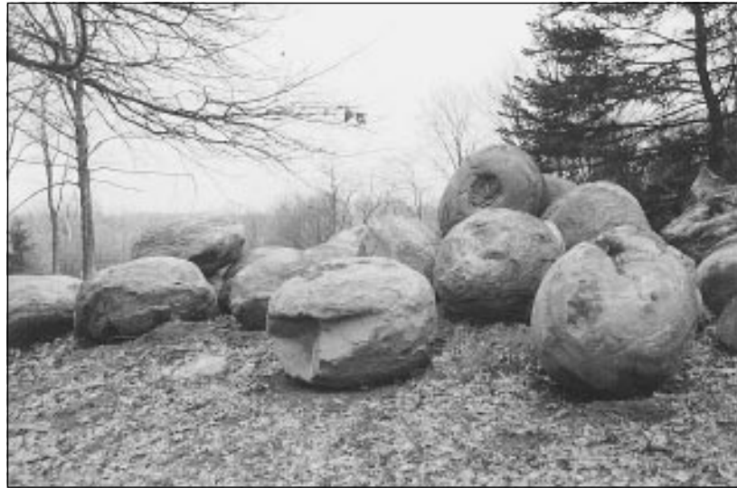
Pile of large "Huron boulders" excavated during construction of a road for a housing development on the west side of Olentangy River Road, Columbus. Several broken concretions revealed black, porous arthrodire bones in their centers. Note the funnel-shaped depression in the concretion at right center.

Large, spherical concretions are confined to the lower 50 feet or so of the Ohio Shale. High cliffs of Ohio Shale along such streams as Scioto Brush Creek in Adams County, Paint Creek in Ross County, Deer Creek in Pickaway County, the Olentangy River in Delaware and Franklin Counties, and the Huron River in Erie and Huron Counties have concretions embedded in the shale. The stream beds are littered with whole concretions as well as ones that have broken into large, angular fragments. The middle part of the Ohio Shale yields small (2-3 inches in diameter), ovoid, ironstone concretions that have a variety of fossils at their center. The upper part of the Ohio Shale has flattened, lenticular, carbonate concretions that commonly contain arthrodire bones; some contain exquisitely preserved remains, including soft tissue, of early sharks.